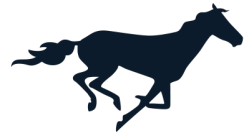
horse on the loose