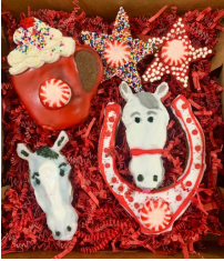
Harlow's Heavenly Horse Cookies